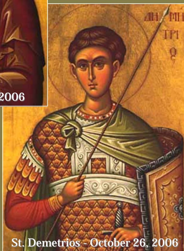
St. Demetrius - October 26, 2006