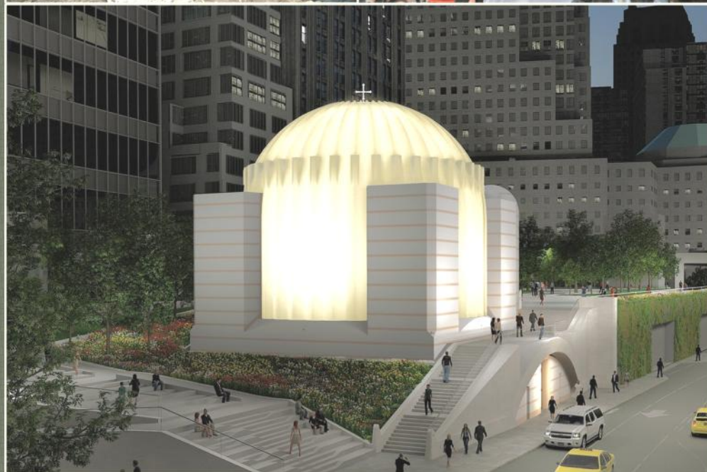
Saint Nicholas National Shrine