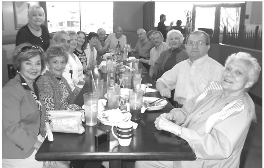
Two Brothers Kitchen, April 3rd, 2014