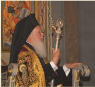
His All-Holiness Bartholomew, Ecumenical Patriarch.

The Orthodox Church is the church of the apostles, the church of the martyrs, the church of the fathers, the church of the councils. Through the centuries, the Orthodox Church convened local and regional, great and greater, as well as universal or ecumenical councils. Just as every celebration of the holy Eucharist is a confirmation of the communion between each person with his or her community, and that local community with the universal Church,