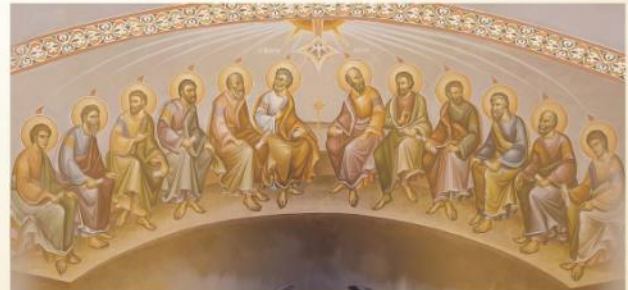
The Holy and Great Council is assembling on the feast of Pentecost.

So, after almost a century, the agenda was finalized, the documents were edited, and the process was completed in January 2016.