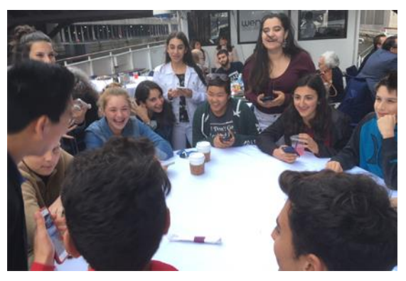
One of the highlights was a boat cruise on the Chicago river where all speakers and families got a chance to relax and enjoy the sights of downtown Chicago.