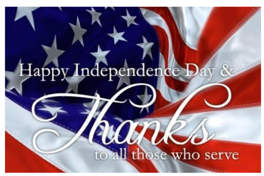
A safe and happy 4th of July celebration to everyone!

In the meantime, when you come across someone whose words and actions seem to reflect the peace of Christ, instead of shooting them a strange look, go up and politely ask if they'll share their secret!